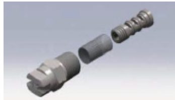
available with strainer assembly